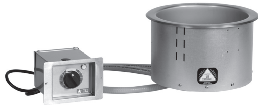
1100-RW (Insert pan not included)